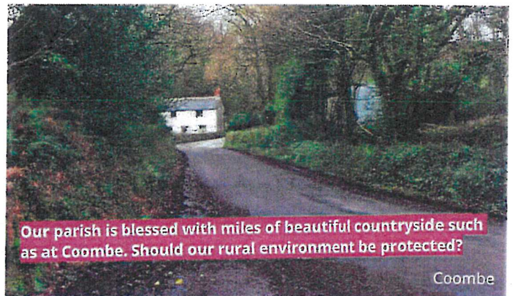
Our parish is blessed with miles of beautiful countryside such as at Coombe. Should our rural environment be protected?